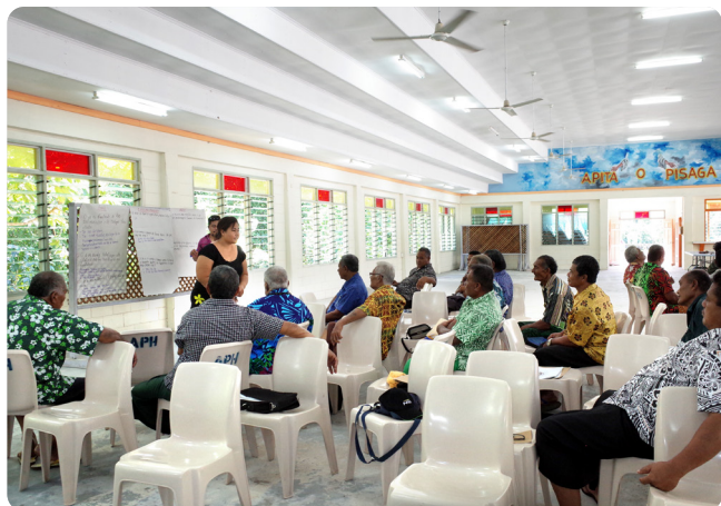
Public consultation for formulation of the strategy (2018)

with principal officials, and public consultations involving representatives from villages across the country. The strategy was officially approved by the cabinet in January 2019. Based on the strategy, J-PRISM II is currently supporting the following activities.