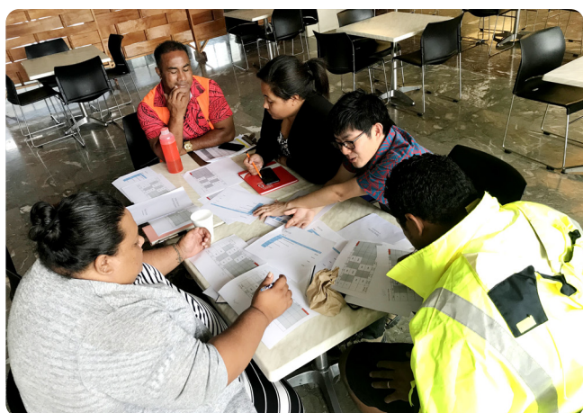
A scene of discussion for trialing the system (2020)

The program was specifically designed to focus on learning from countries where a user-pays system for waste collection was already in place. This enabled the participants to have very practical discussions with the local officials on merits and demerits, considerations and pitfalls, when introducing the system, as well as tasks for the future. Based on the results of the training, the Waste Management Section prepared a draft proposal for a user-pays system of waste collection and discussed it with high-level