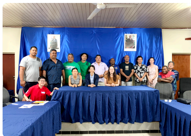
A scene of discussion for trialing the system (2020)