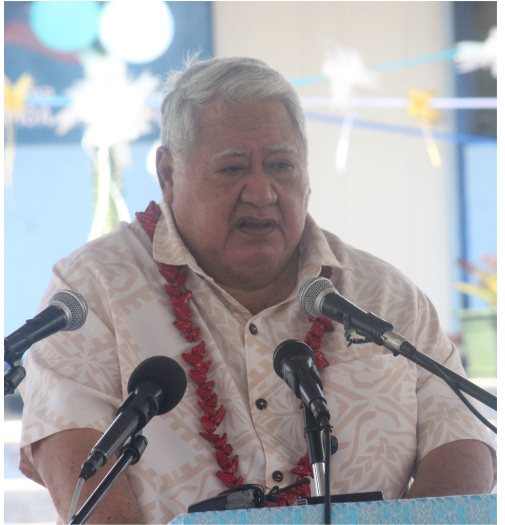
Palemia Tuilaepa Sr. Sailele Malielegaoi