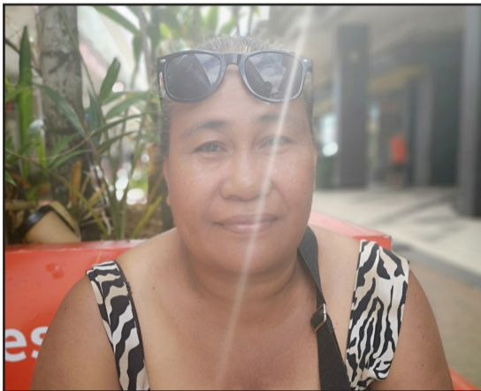
Fipe Mautu Fou 48 tausaga o Sa'anapu

I lo'u taofi, a'o i ai Samoa i le Poloa'iga o Fa'alavelave Tutupu Fa'afuase'i, tatou talia nei suiga fou, o suiga lelei, a'o se fesoasoani sili fo'i lea mo aiga ta'itasi i taimi o fa'alavelave, ina ia tatou fa'atino le mea ua maua i lo tatou mafai, e aunoa ma le toe fa'alagolago i tatou fanau ma aiga i atunuu i fafo.