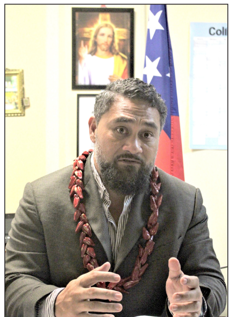
Electoral Commissioner Faimalomatumua Mathew Lemisio.

According to reports the two sections of the Act under questioned dealt with the eligibility of potential candidates to run for Parliament, and the authorities given to