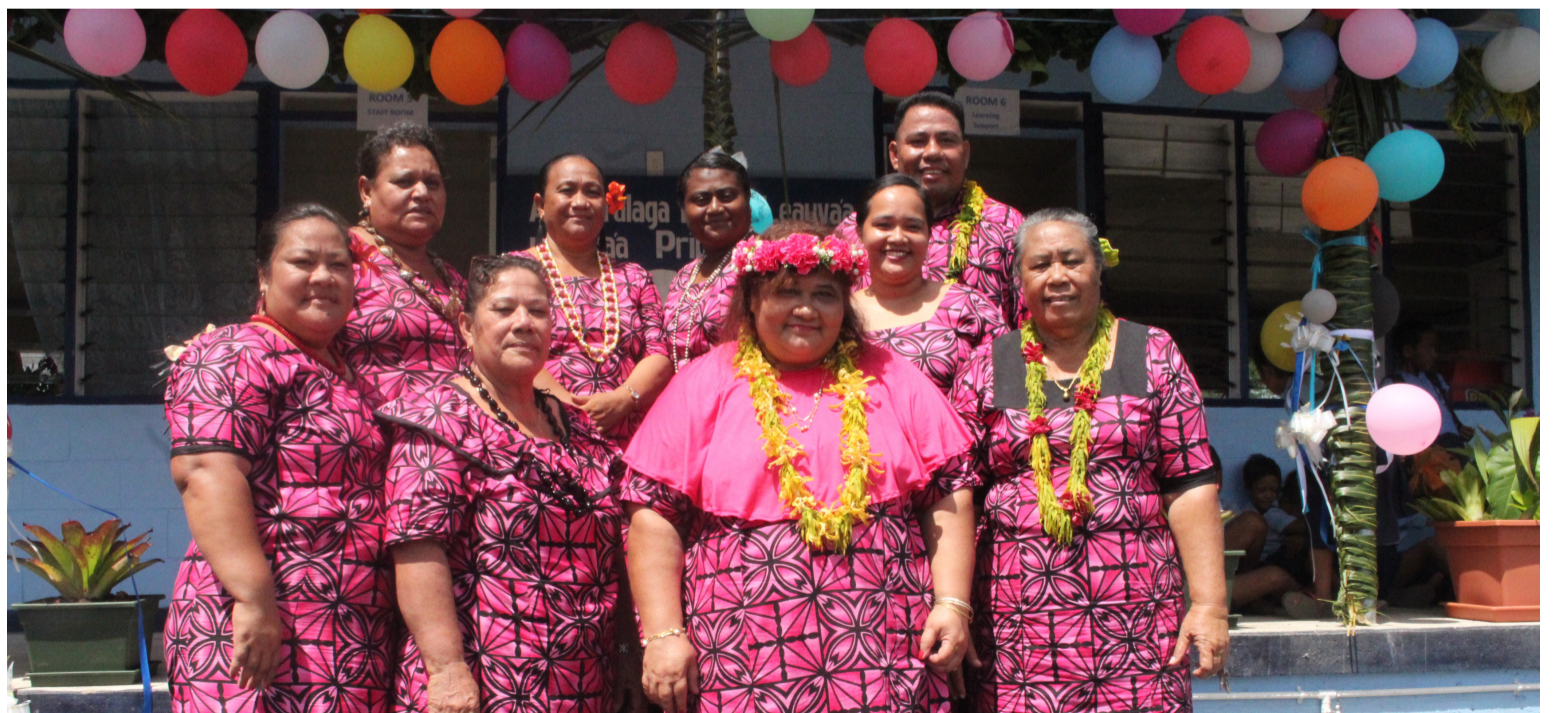
Laufogaga fiafia o le aiga faiaoga a le Aoga Tulagalua a Leauvaa.

"Mo fanau aoga, O nai tou mātua aemaise le tou nu'u sa galulue malosi ina ia fa'aleleia le tou faleaoga aua le manuia o tou a'oa'oga. O matou mai Iapani, ua na'o le fesoasoani mai lava. Ia outou fa'afetaia ma amanaia le galuega fitā a nai outou mātua fa'apea le tou nu'u ile toaga e su'esu'e,