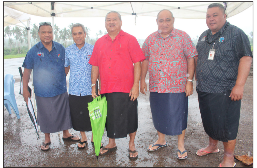
Cabinet Ministers and Senior Government Official during their on-site inspection visit last week.