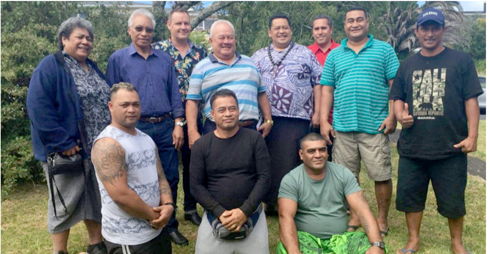
Minister of Commerce Industry and Labor, Lautafi Fio Selafi Purcell and CEO of MCIL, Pulotu Lyndon Chu Ling with Samoan RSE workers during a Ministerial recent visit in New Zealand.

The inter-island and regional flights will utilize the Ti'avea Airport currently under construction to complement Faleolo International Airport.