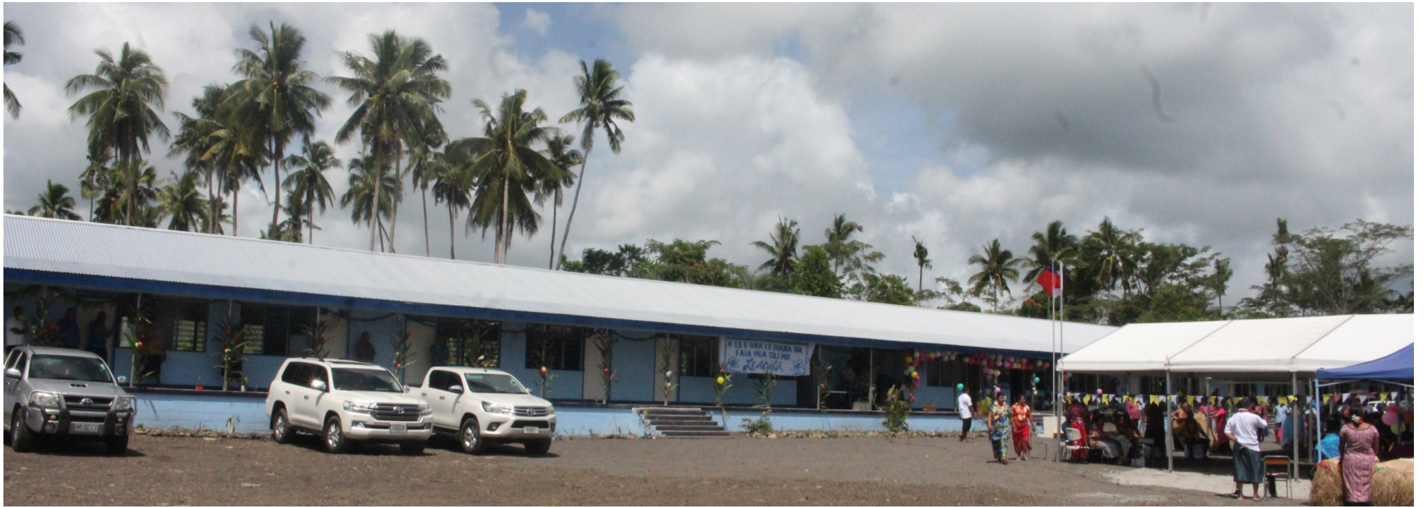
Tu le faleaoga fou a le Aoga Tulagalua i Leauvaa.