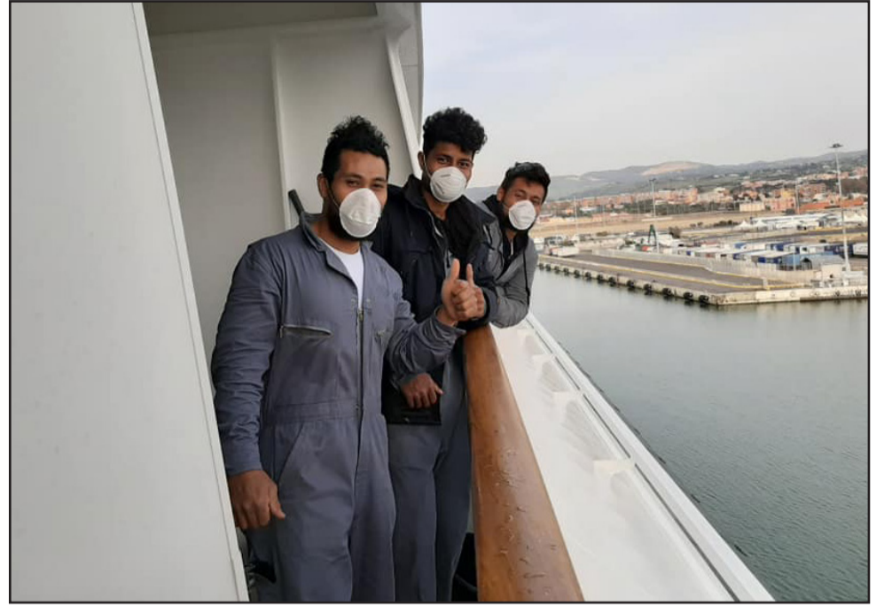
93% of the 323 sailors working with MSC have been re-employed during the COVID19 pandemic. The MSC have requested an additional 80 more sailors from Samoa.