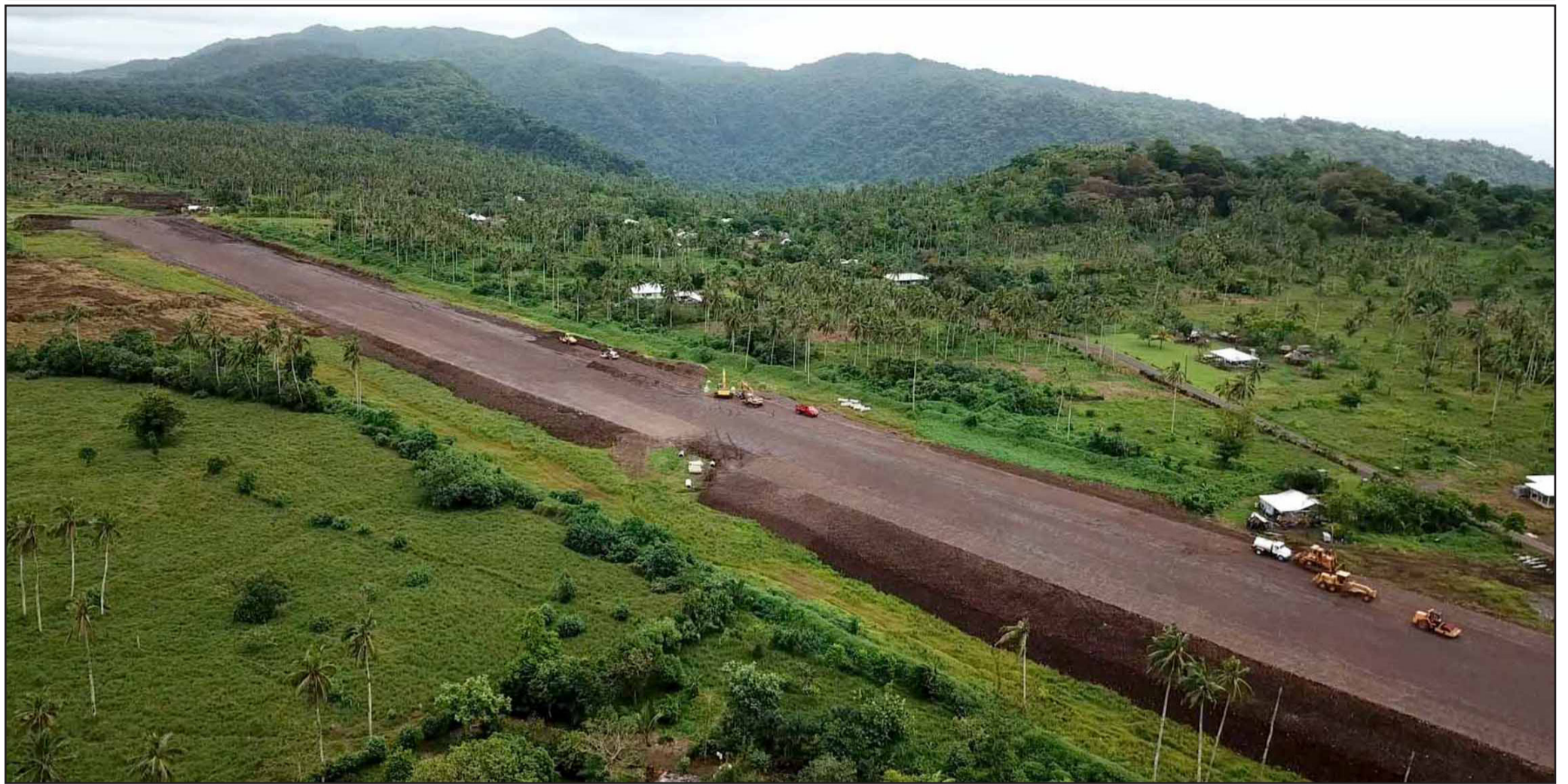
Ti'avea Airport under construction.