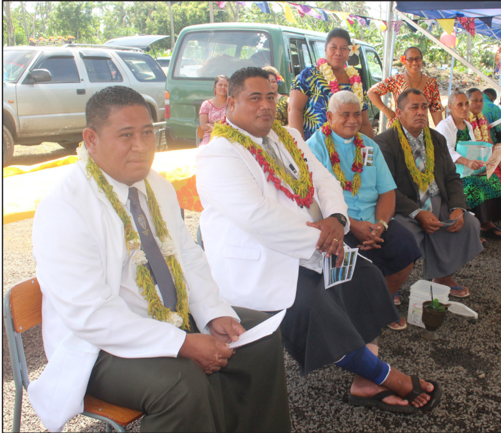
Leauvaa Village Church Ministers at the school opening.