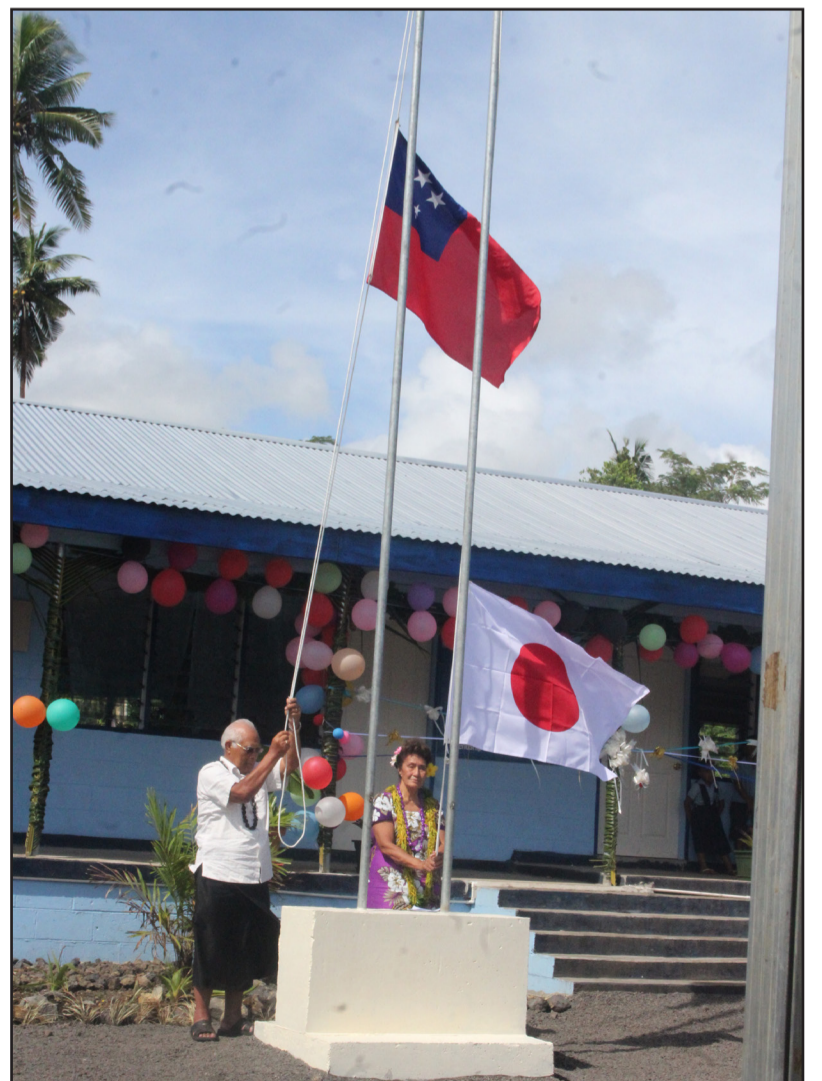
Raising of the flag.