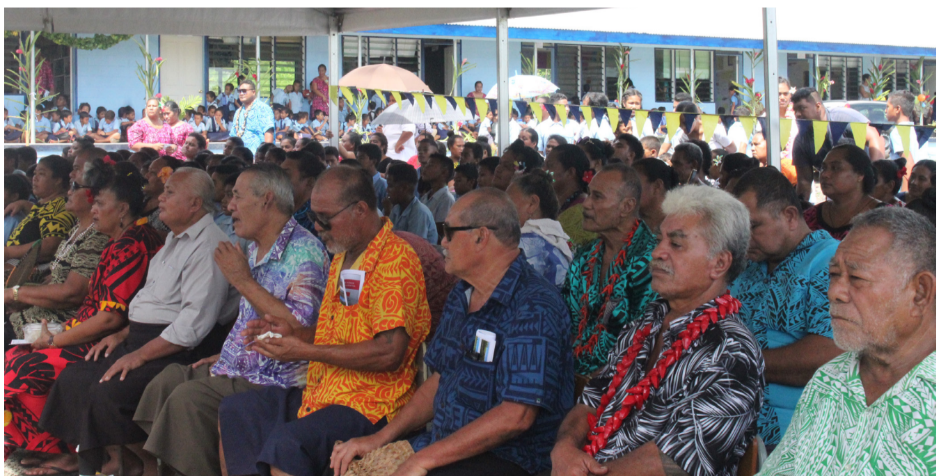
Molimauina o le tatala aloaia o le faleaoga fou o le Aoga Tulagalua I Leauvaa.