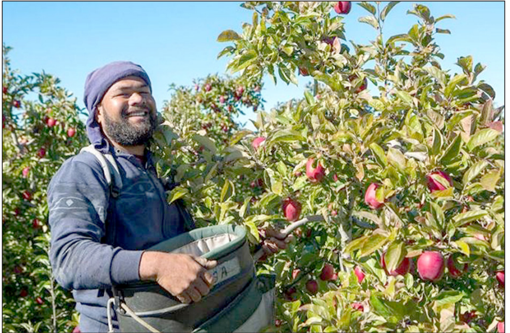
Se tasi o tamafanau a le atunuu o lo'o galue i galuega fa'avaitaimi.